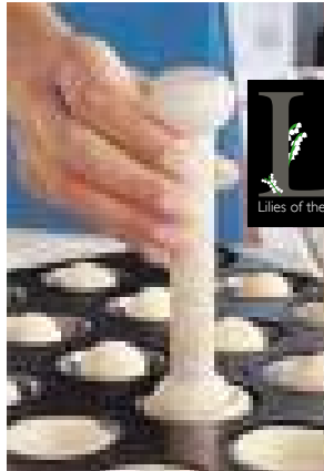
Mini muffin pan & tart shaper

the local charity that supports and encourages young mothers and operates from 72 Cavendish St. in Keighley. [www.liliesofthevalley.org.uk] For every mini muffin pan and tart shaper ordered this month, £4 will be donated to LofV. The mini muffin pan is so easy to use; just roll a small ball of ready made pastry (about the size of a large marble), pop it in each cup and press firmly with the tart shaper. You can also use it for