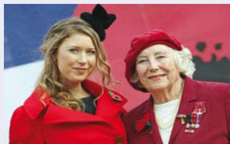
Hayley Westenra and Dame Vera Lynn launch the 2009 Poppy appeal.

Forces sweethearts from yesterday and today joined hands to launch the 2009 Poppy Appeal in support of the Afghan generation of Armed Forces wounded and bereaved.